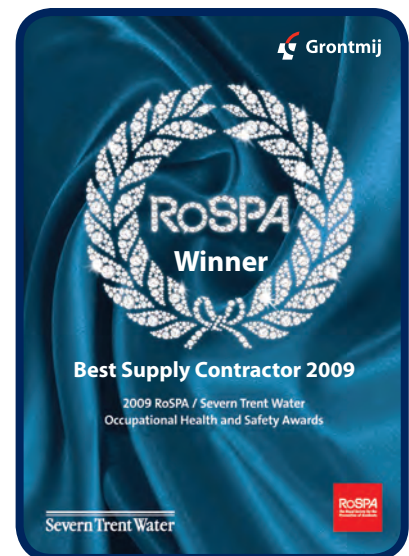
RoSPA Best Supply Contractor 2009 Certificate

Grontmij exceeded the expectations of Severn Trent Water in receiving the Gold Award in the first year of the competition. Grontmij also took the top award by successfully winning the Best Supplier Contractor . This was in the face of strong competition from other Severn Trent Water suppliers like Black and Veatch, Severn Trent Alliance, Biwater Treatment Limited and OnSite Central Ltd.