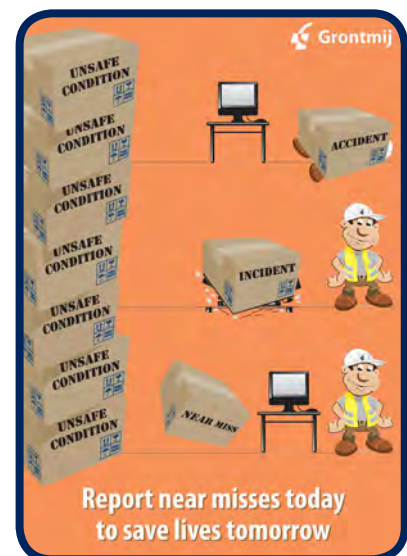
Near miss campaign poster series

Entrants must answer a number of key performance questions and submit a portfolio folder of supporting evidence. RoSPA and Severn Trent also took into account the companies' safety track records and their efforts to inform and engage employees in order to promote a positive safety culture within their organisation.