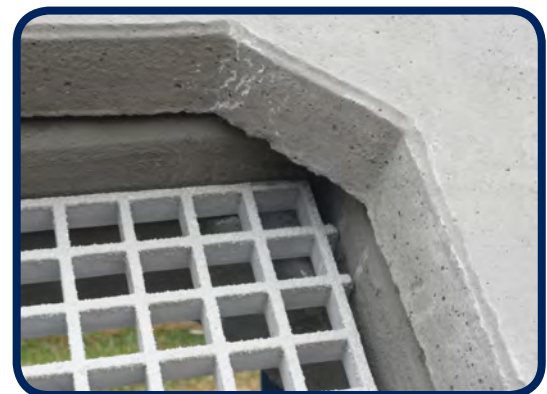
Close up of grid

This joint submission won the top prize in its category. Following this award, Severn Trent has announced that it is considering using the design in the near future.